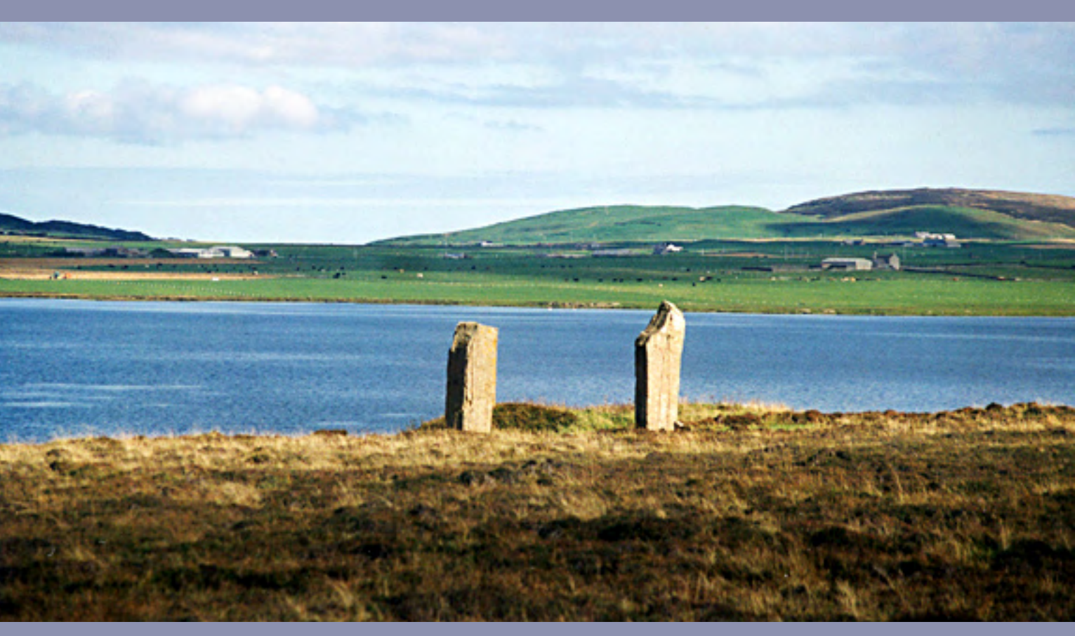
Gateway to Circle of Brodgar - Orkney, Scotland